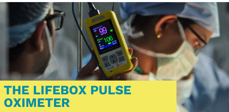
THE LIFEBOX PULSE OXIMETER

Despite being universally mandated in high-income countries, capnographs are nearly entirely absent from low-resource settings. Smile Train and Lifebox are tackling this major gap in anesthesia safety with the Smile Train-Lifebox Capnograph: A high quality, affordable capnograph suited for use in low-resource settings. Lifebox and partner Smile Train are in the process of equipping 650 operating rooms including Benin, Ethiopia, Philippines, and Uganda.