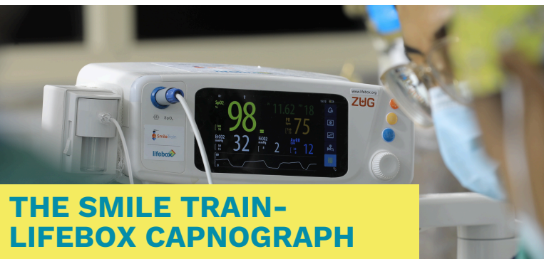
THE SMILE TRAIN-LIFEBOX CAPNOGRAPH

Despite being universally mandated in high-income countries, capnographs are nearly entirely absent from low-resource settings. Smile Train and Lifebox are tackling this major gap in anesthesia safety with the Smile Train-Lifebox Capnograph: A high quality, affordable capnograph suited for use in low-resource settings. Lifebox and partner Smile Train are in the process of equipping 650 operating rooms including Benin, Ethiopia, Philippines, and Uganda.